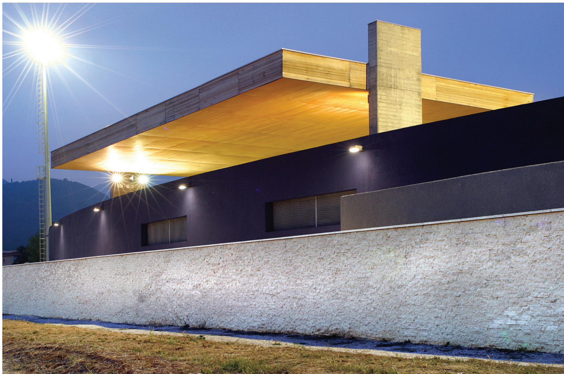
Municipal stadium - Botticino