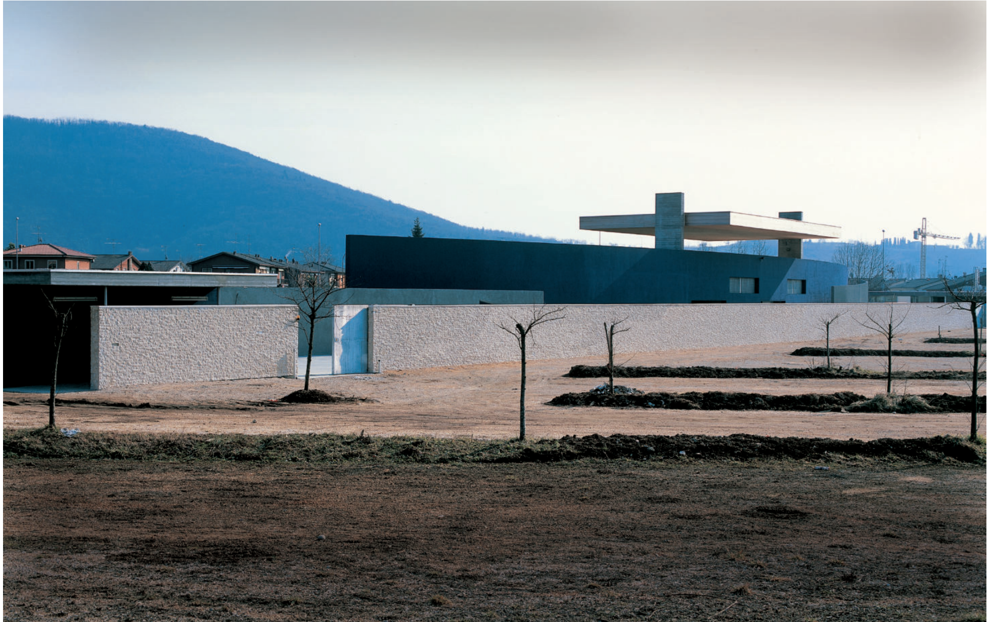
Municipal stadium - Botticino