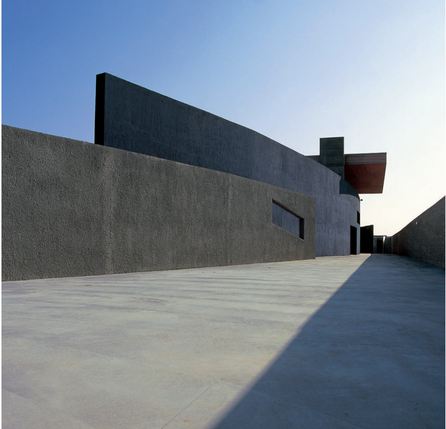
Municipal stadium - Botticino