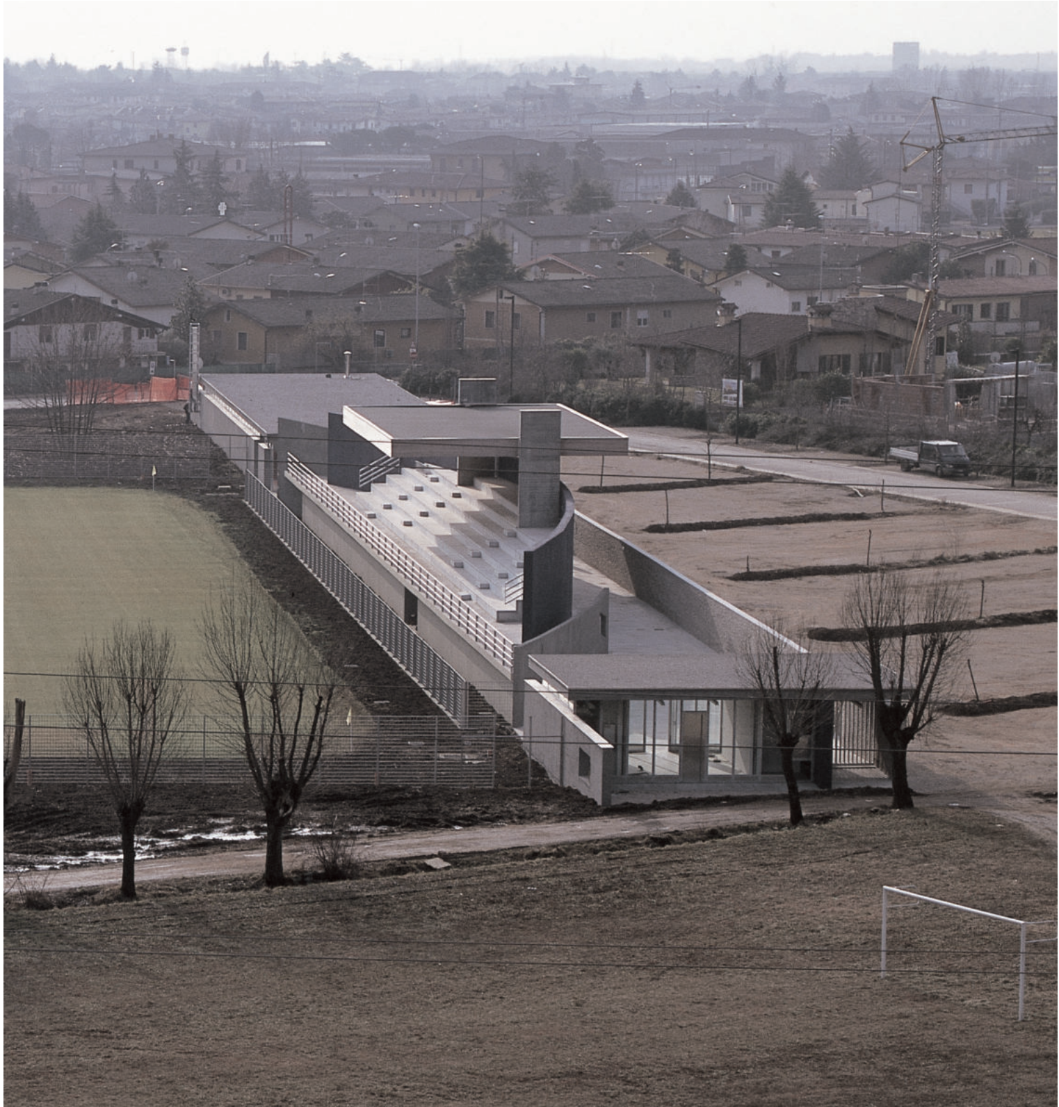
Municipal stadium - Botticino