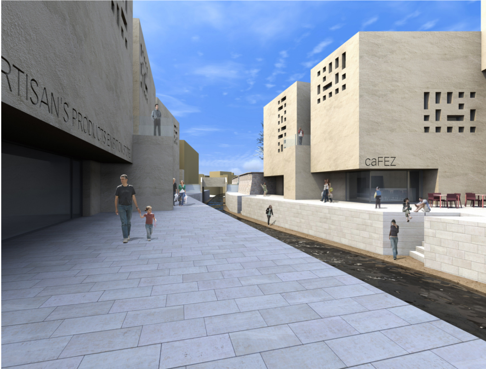
Place Lalla Yedouna - Fez