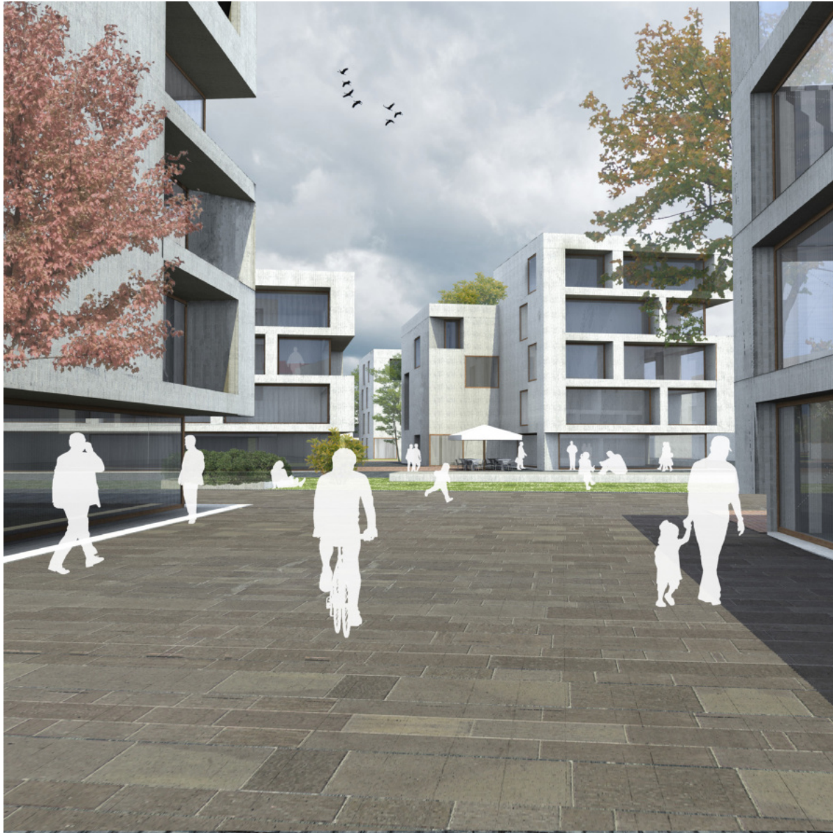
Nördliches Ringgebiet - Braunschweig