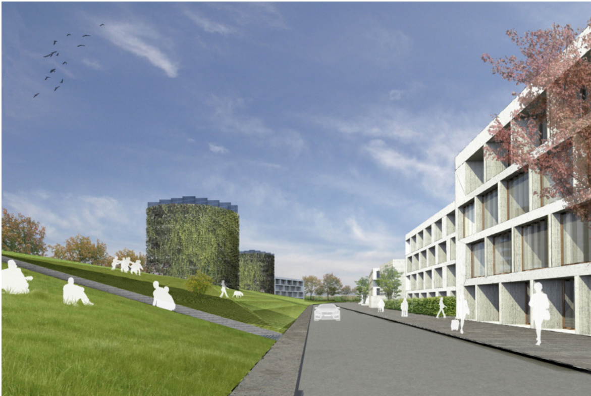
Nördliches Ringebiet - Braunschweig