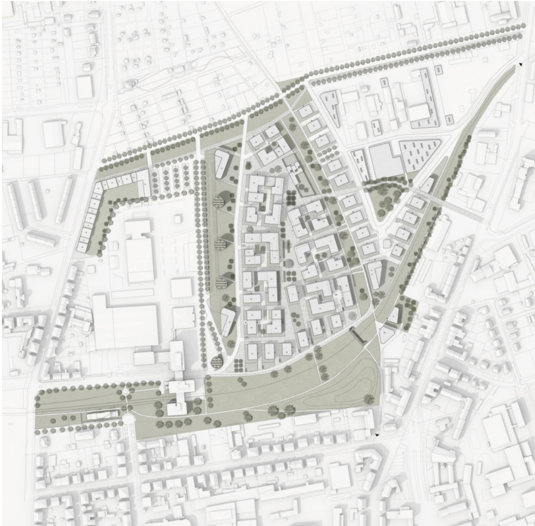
Nördliches Ringgebiet - Braunschweig