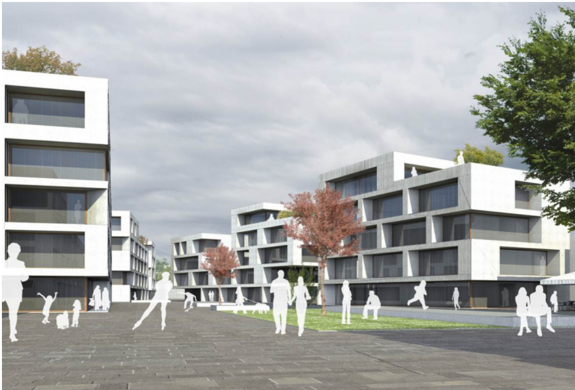
Nördliches Ringgebiet - Braunschweig