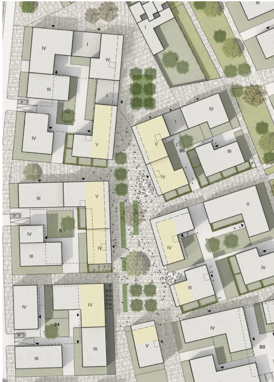
Nördliches Ringgebiet - Braunschweig